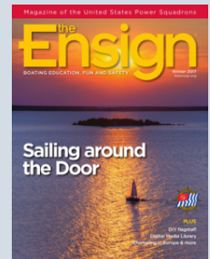
Ensign - Winter2017